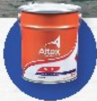
Paint and Maintenance